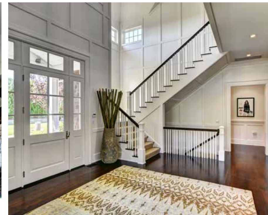
Double Height Entry