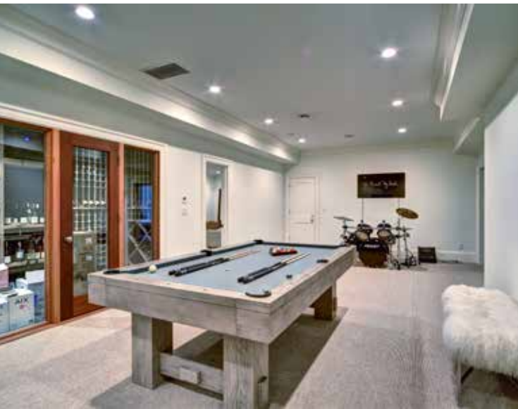
Recreational Area & Wine Cellar