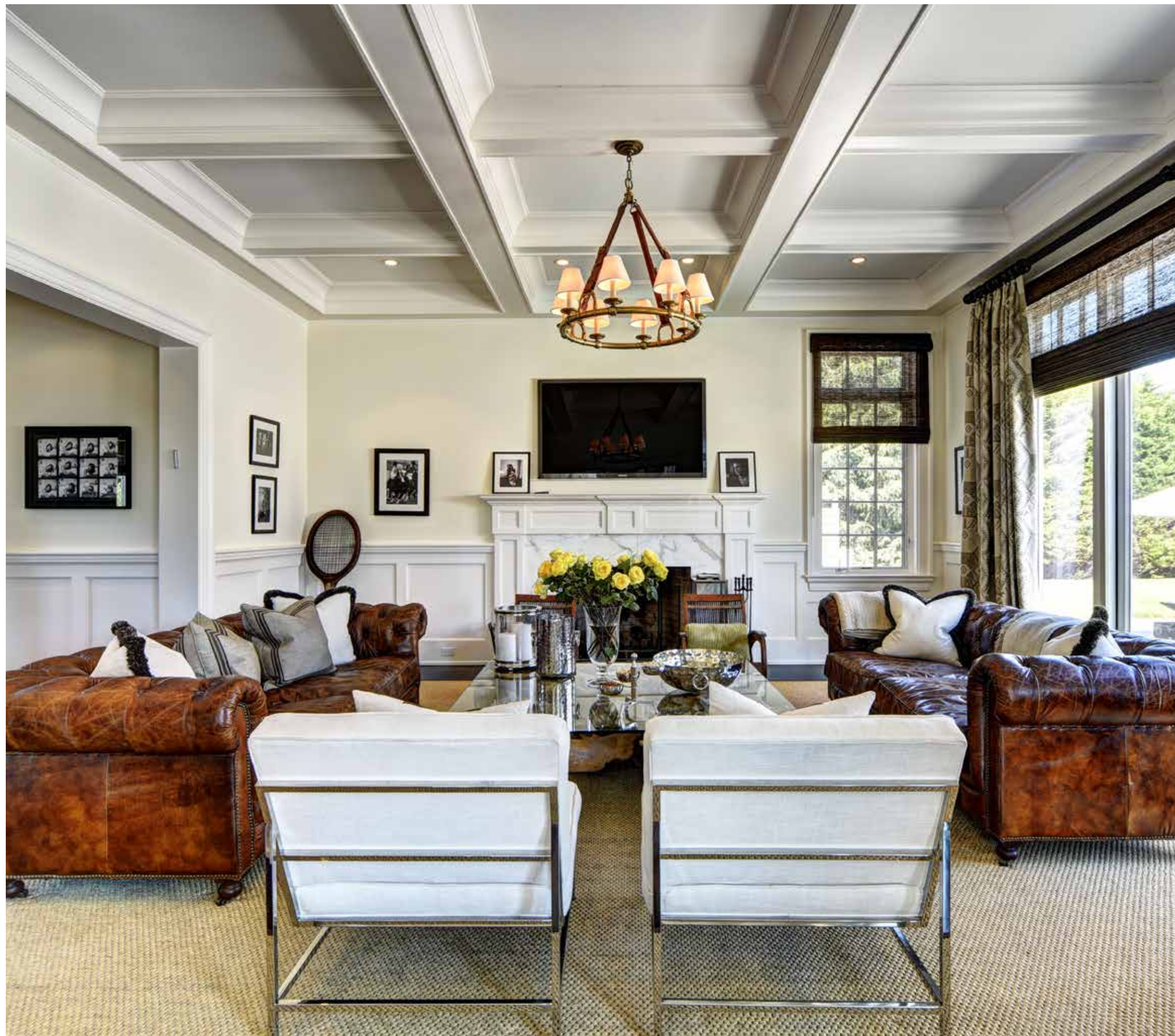
Great Room with Fireplace