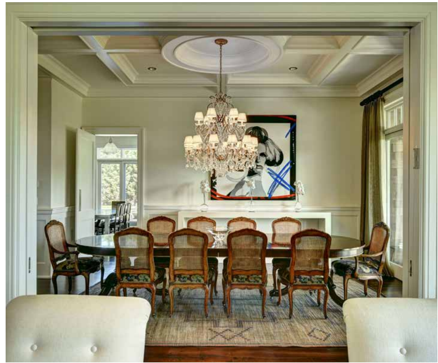
Formal Dining Room