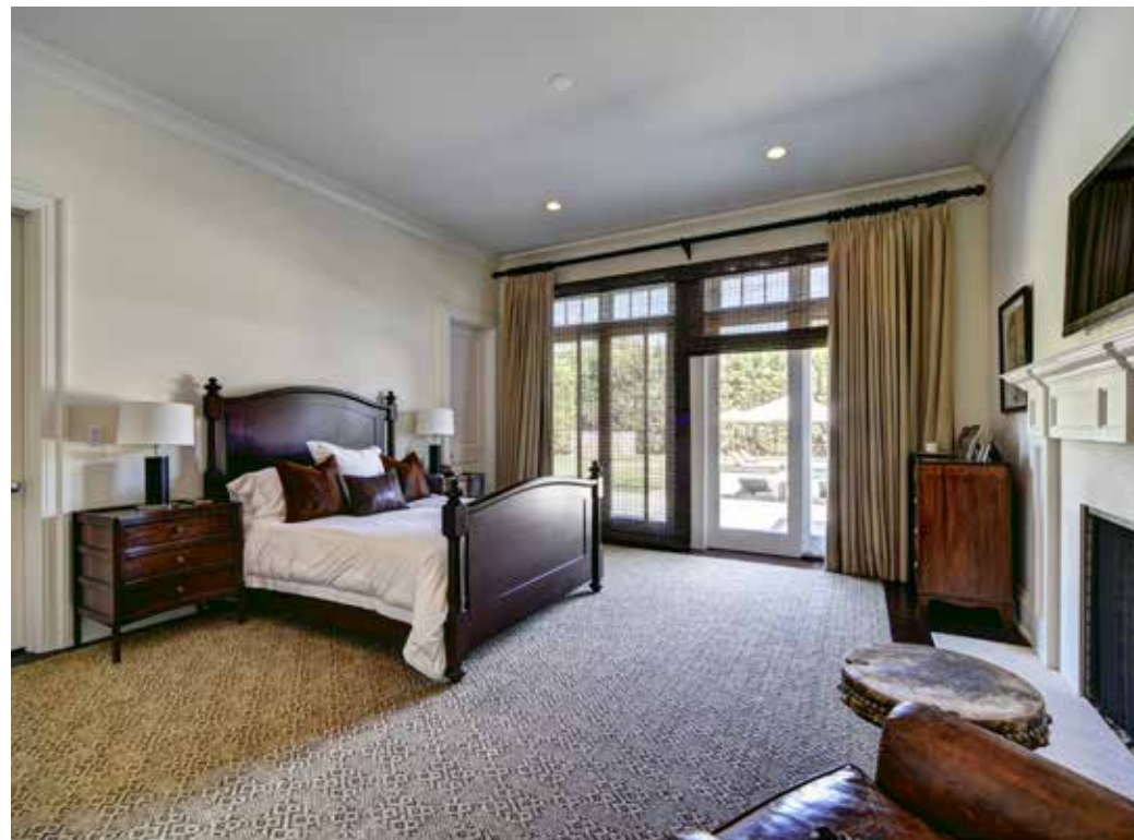
First Floor Jr. Master Bedroom