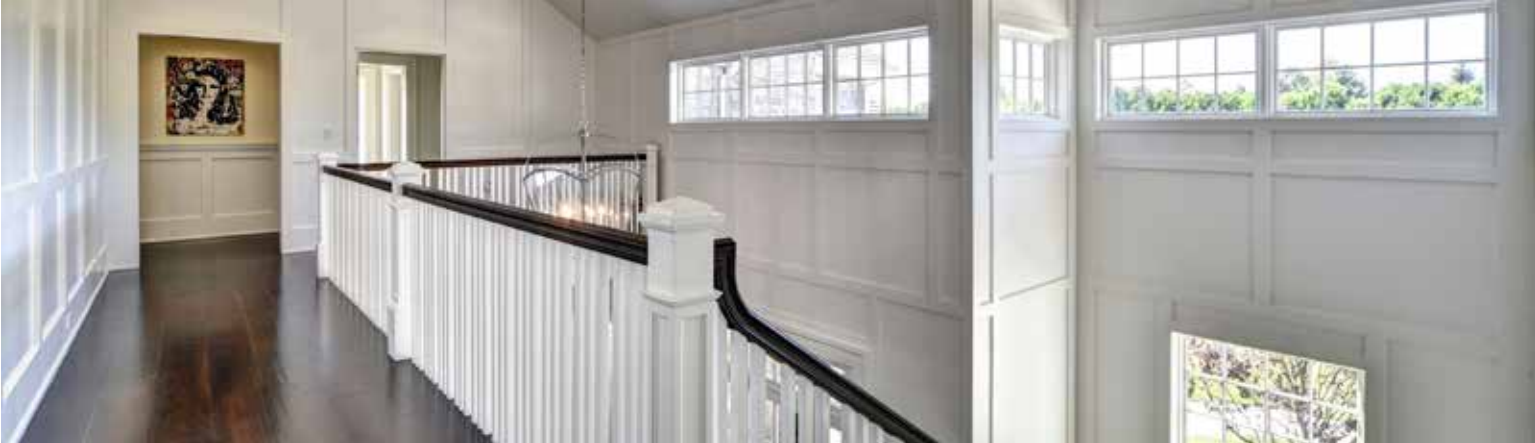
Second Floor Landing