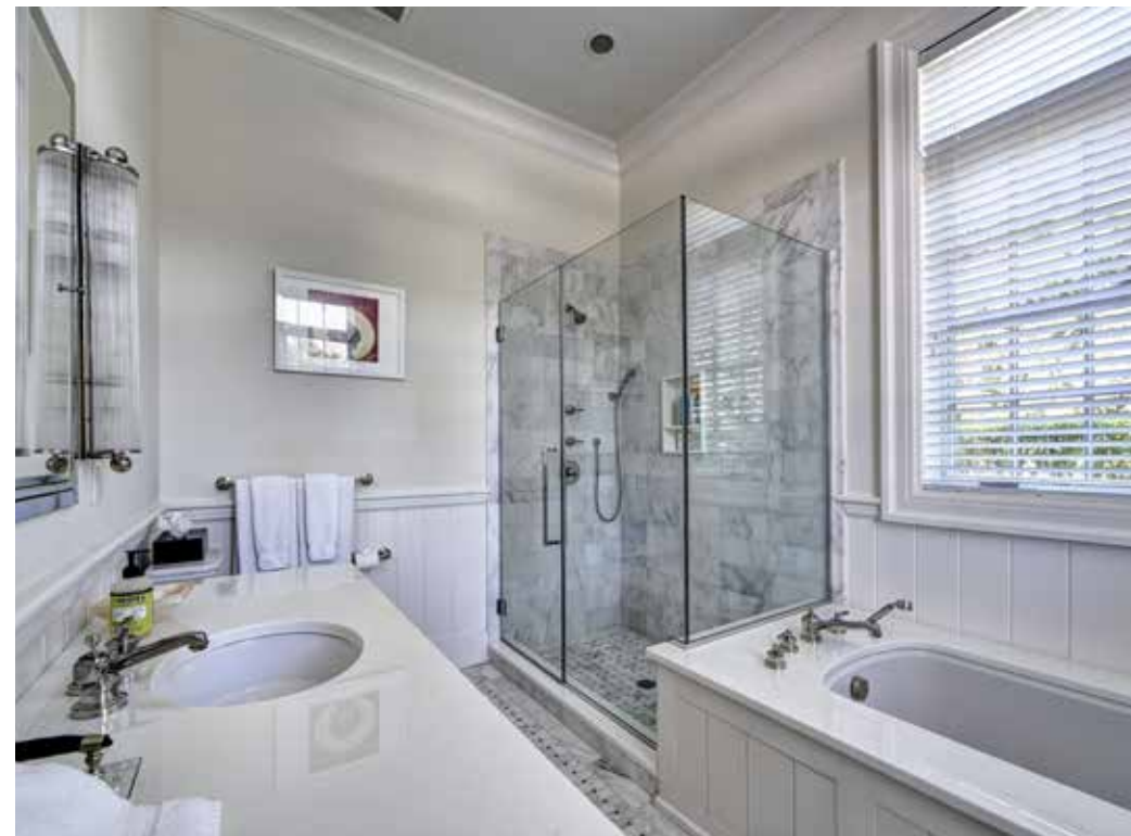
First Floor Jr. Master Bathroom