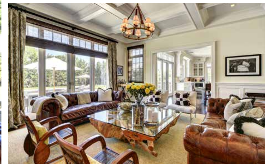
Great Room with Fireplace