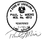
EXHIBIT SHOWING PROPERTY BELONGING TO CARMEL DEVELOPMENT OF LAFAYETTE INC. BEING 93.03 ACRES LOCATED IN SECTION 92, T8S, R5E, PARISH OF LAFAYETTE, LOUISIANA DATE OF PLAT: JANUARY 12, 2016