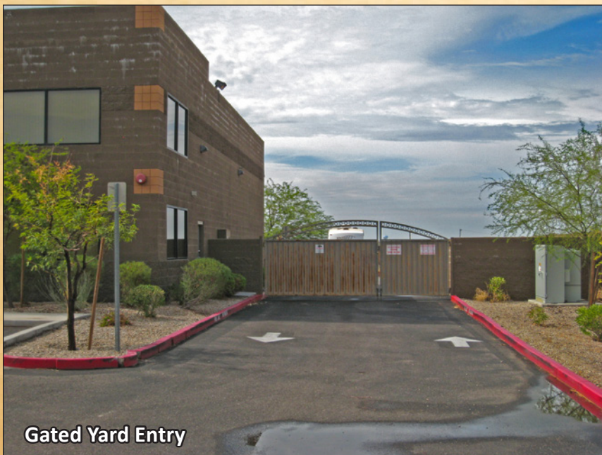
Gated Yard Entry