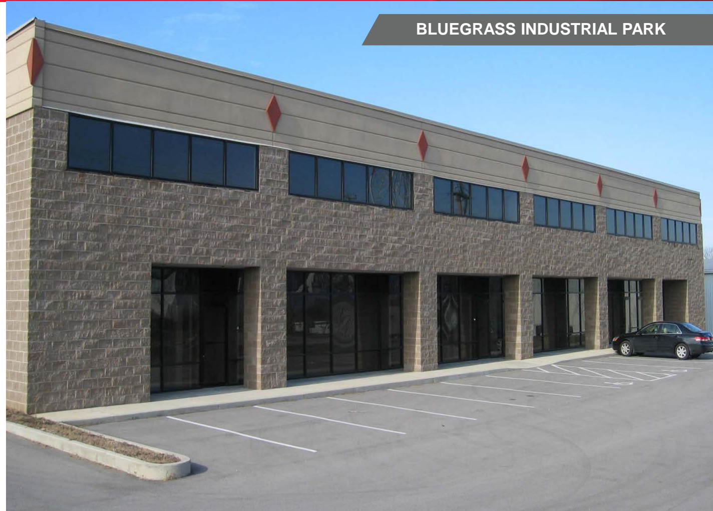
BLUEGRASS INDUSTRIAL PARK