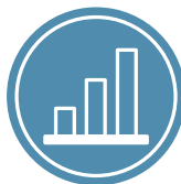
Demographics: CoStar 2019