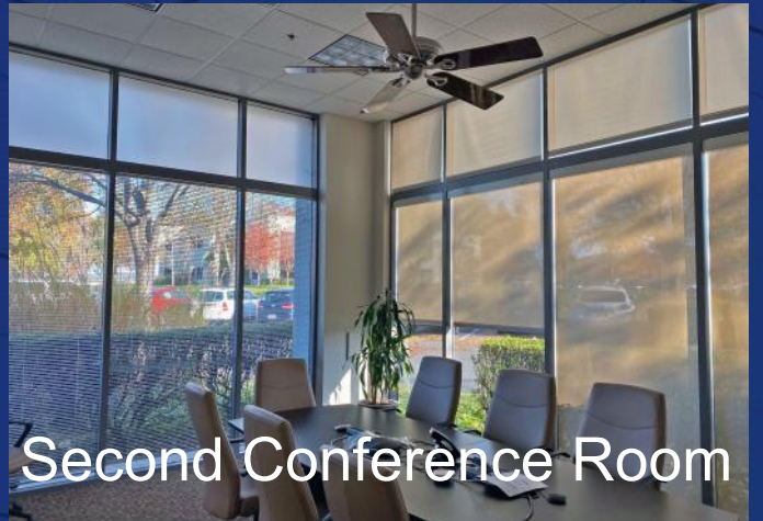
Second Conference Room