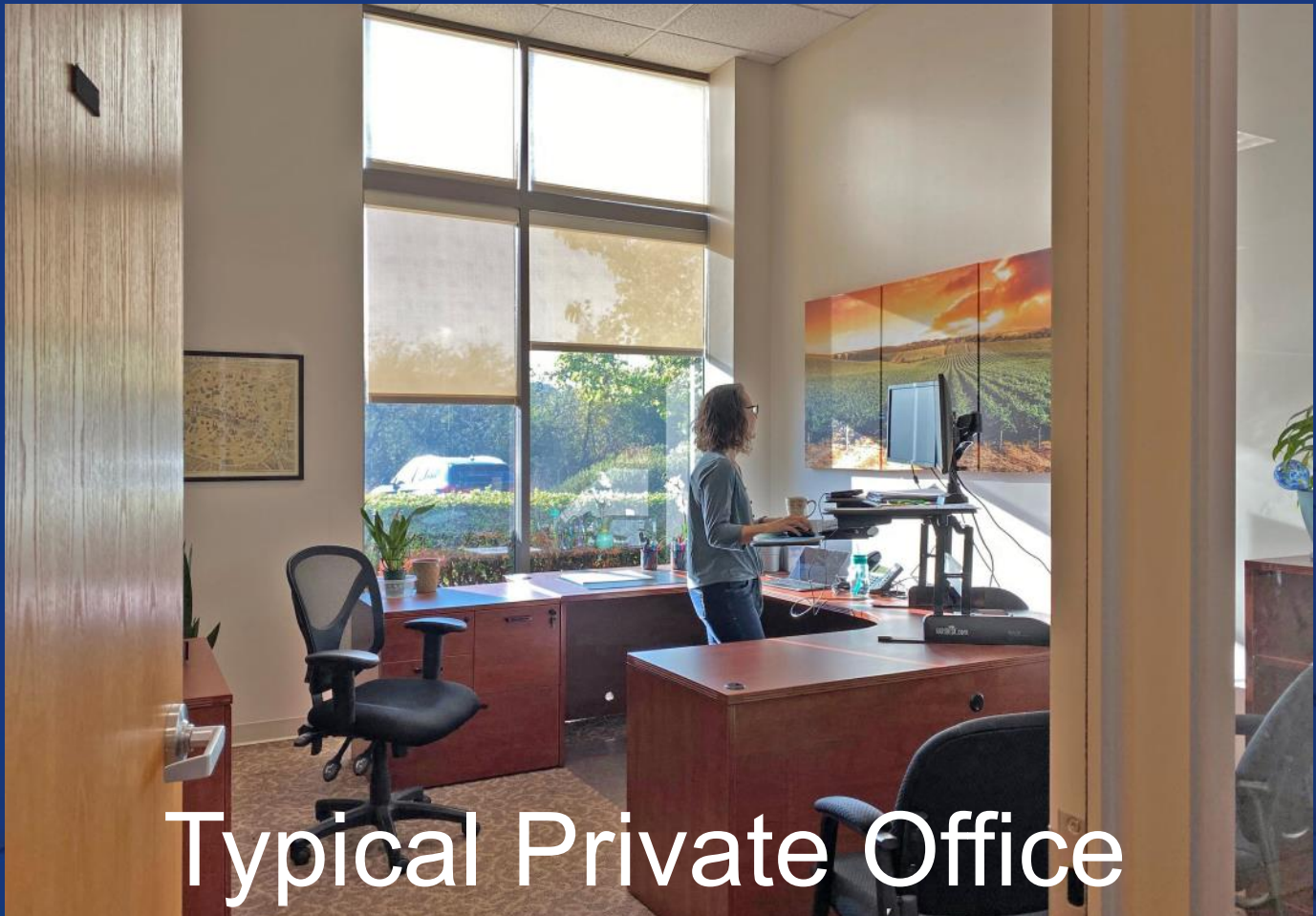
Typical Private Office