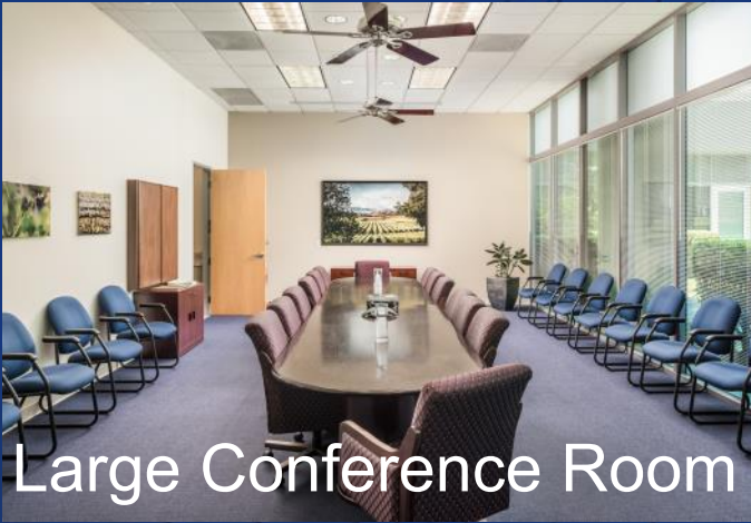
Large Conference Room