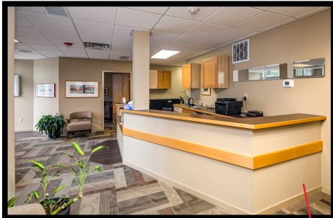
Reception Desk from Front