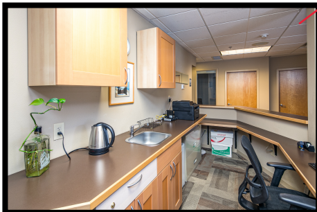
Reception from Behind Desk