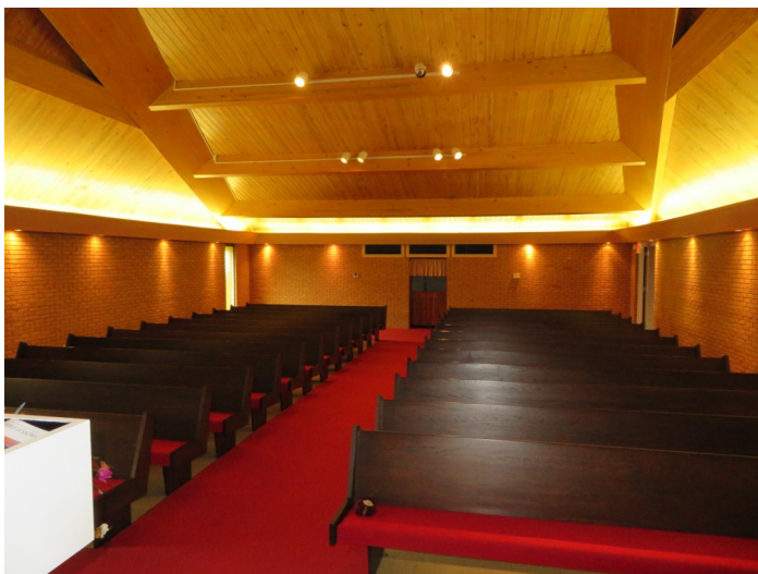
View from Pulpit