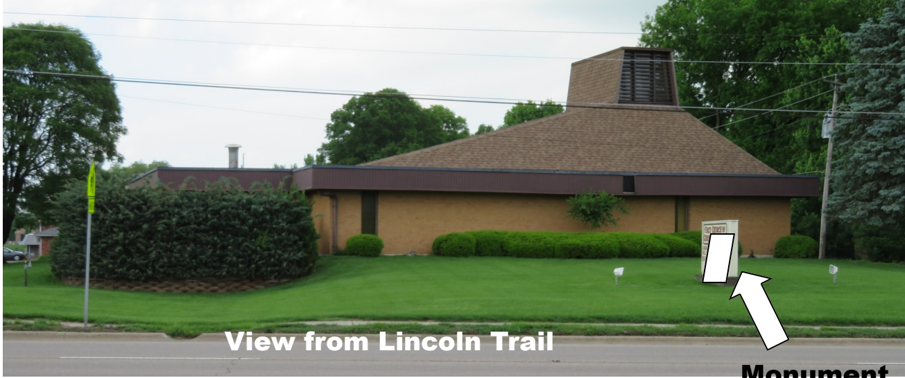
View from Lincoln Trail