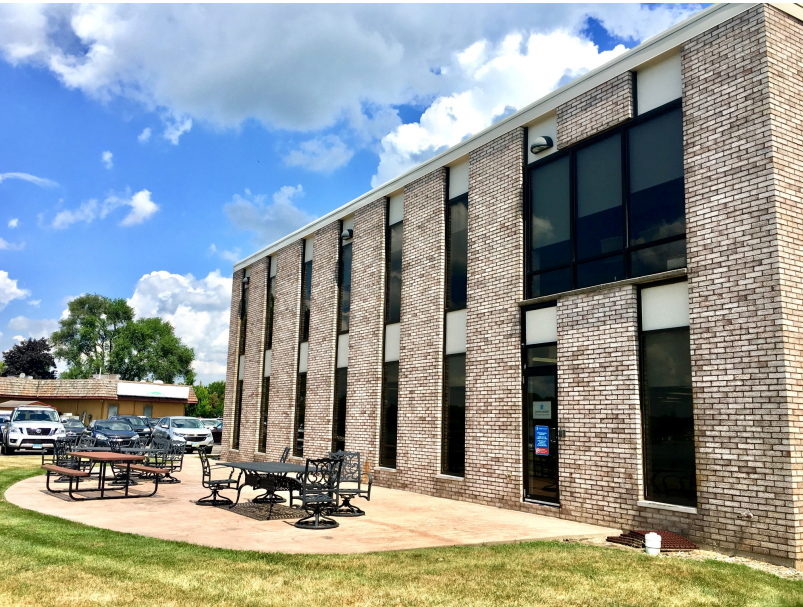
Lake side patio, includes natural gas connections for grills

737 NORTH DETROIT STREET, WARSAW, IN 46580