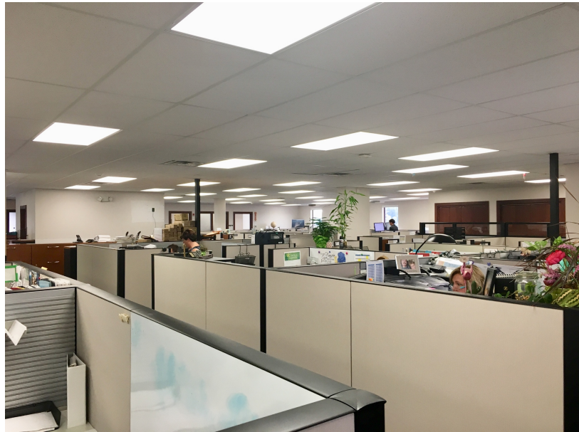
Second floor cubicle work area