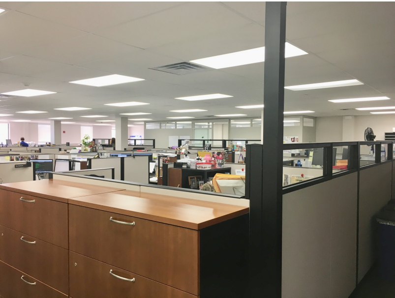
First floor cubicle work area

737 NORTH DETROIT STREET, WARSAW, IN 46580