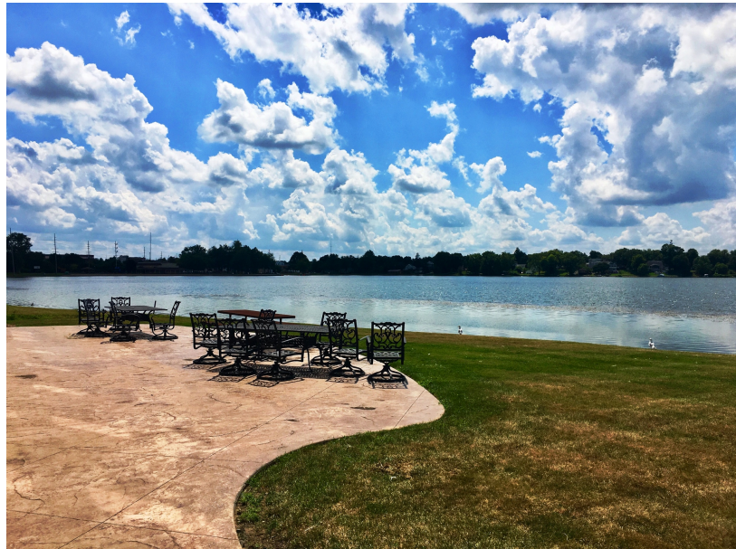
Lake side patio