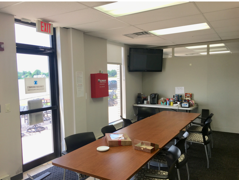
First floor break area, includes access to outdoor patio