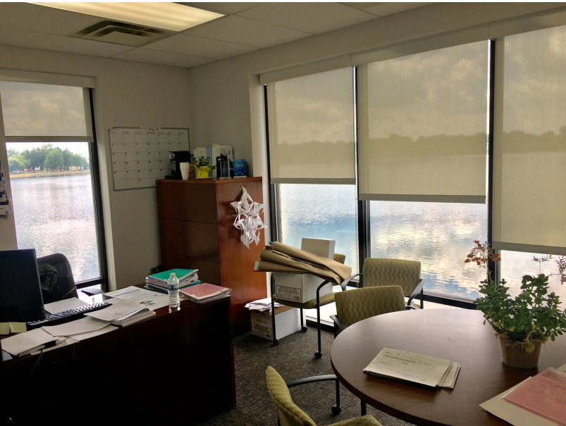
Private office with lake view