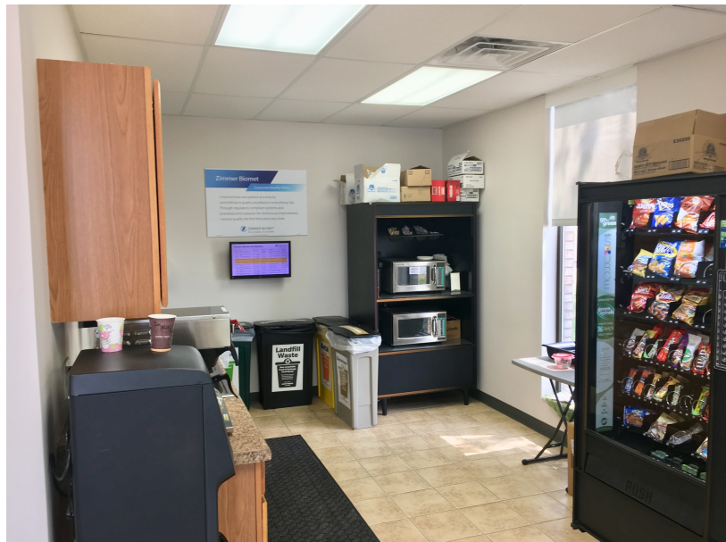
First floor break area