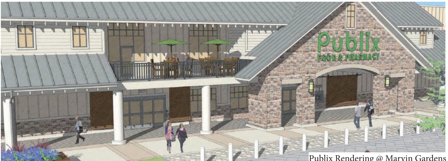
Publix Rendering @ Marvin Gardens