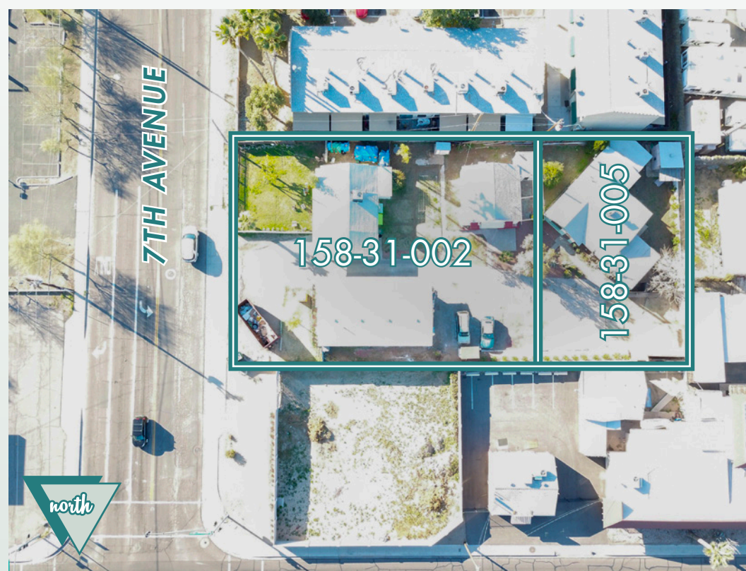
(VIEW FROM PROPERTY LOOKING NORTH)

JUST STEPS FROM SHANGRI-LA ARE THE GRAND CANAL AND THE NORTH MOUNTAIN & SHAW BUTTE TRAILHEADS, WHICH PROVIDE MILES OF HIKING AND BIKING TRAILS RANGING FROM EASY TO DIFFICULT.