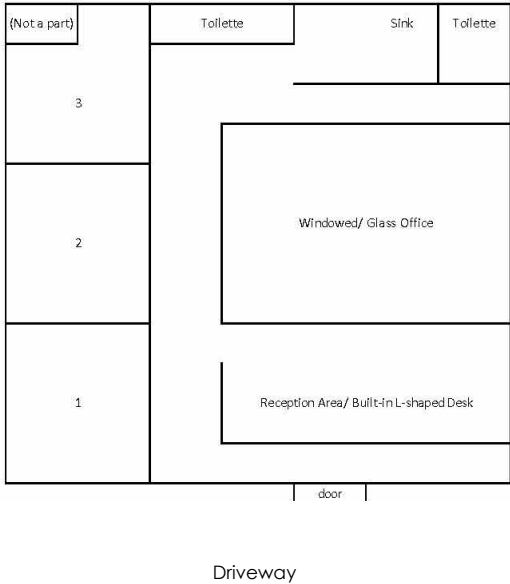
914 N. Formosa