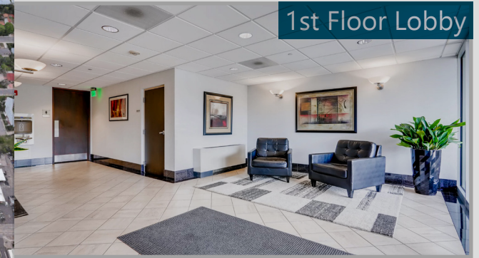
1st Floor Lobby