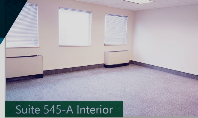
Suite 545-A Interior