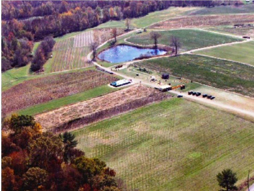
Secor Farm - Secor Strawberries Inc.