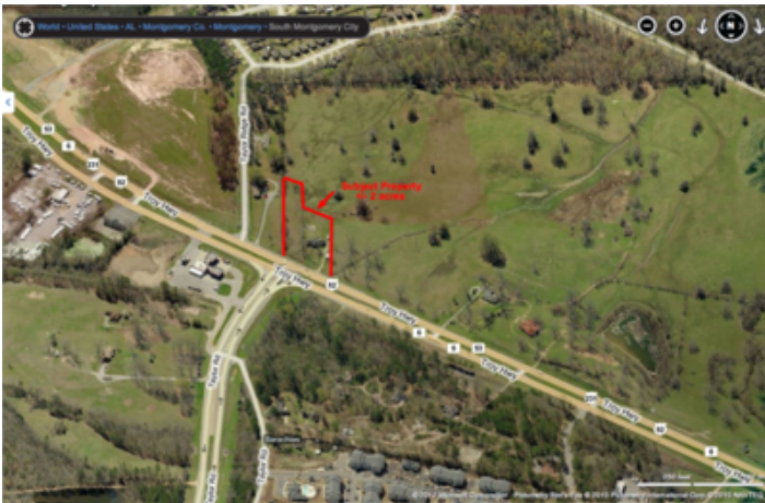
Wide Aerial Photo