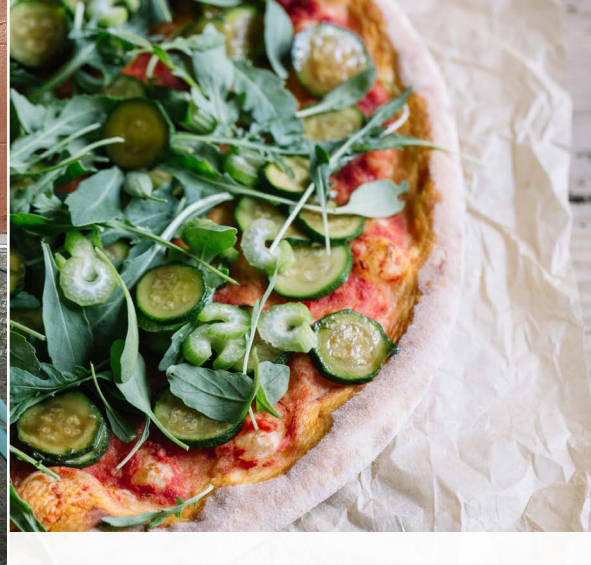
WELCOME TO SANTA MARIA