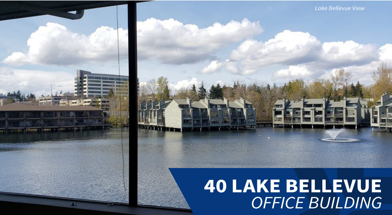
Lake Bellevue View