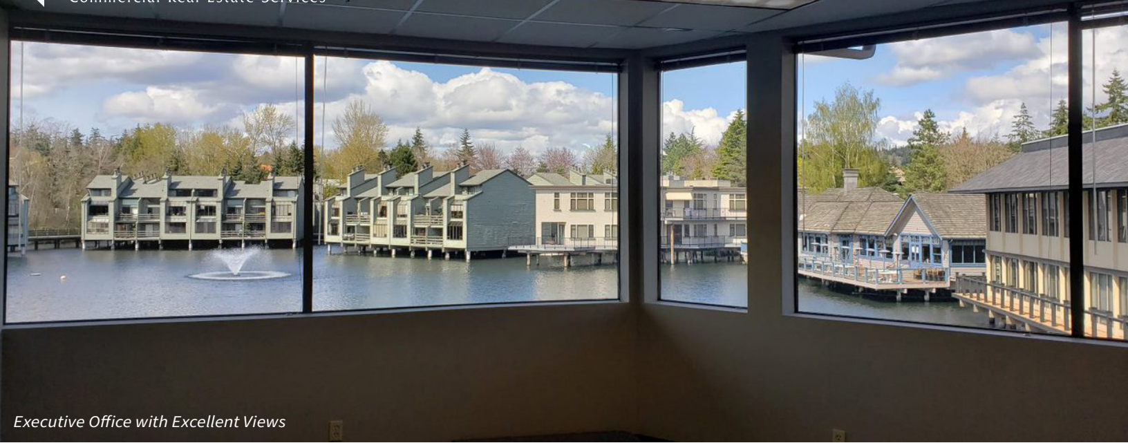
Executive Office with Excellent Views