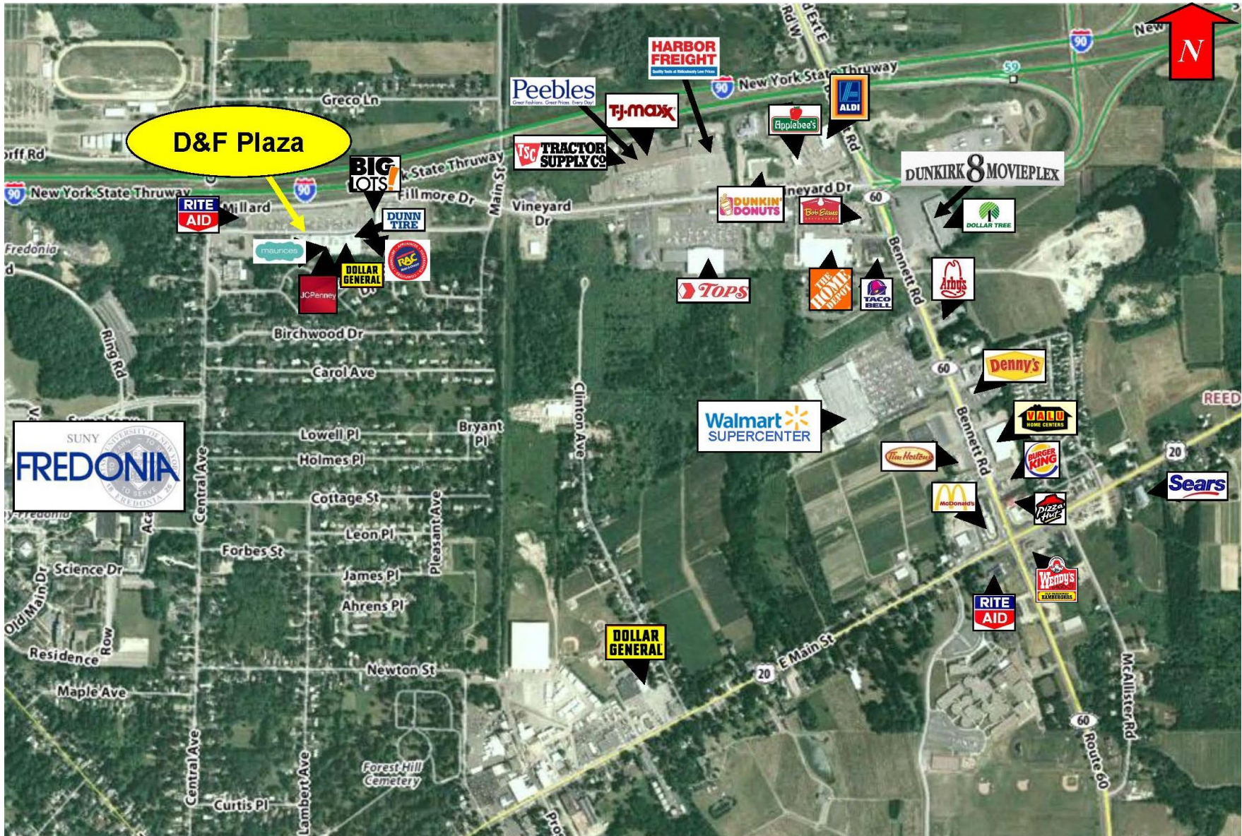
Trade Area Map