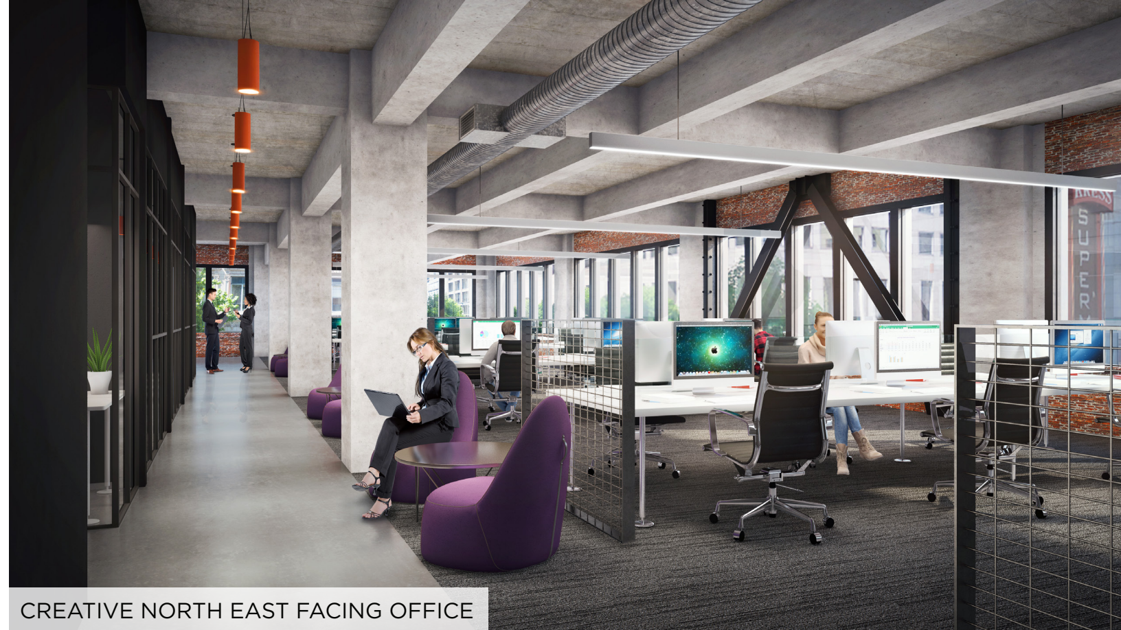
CREATIVE NORTH EAST FACING OFFICE