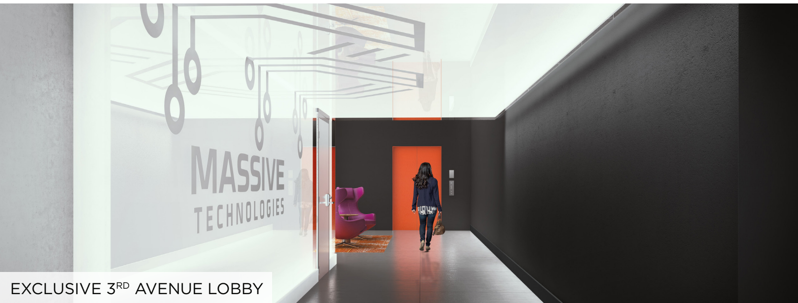
EXCLUSIVE 3 RD AVENUE LOBBY