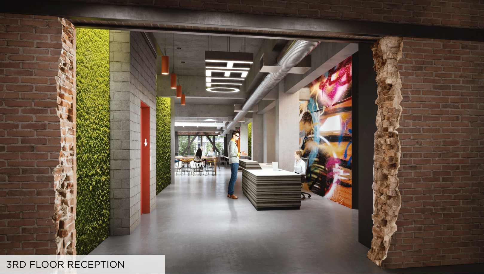
3RD FLOOR RECEPTION