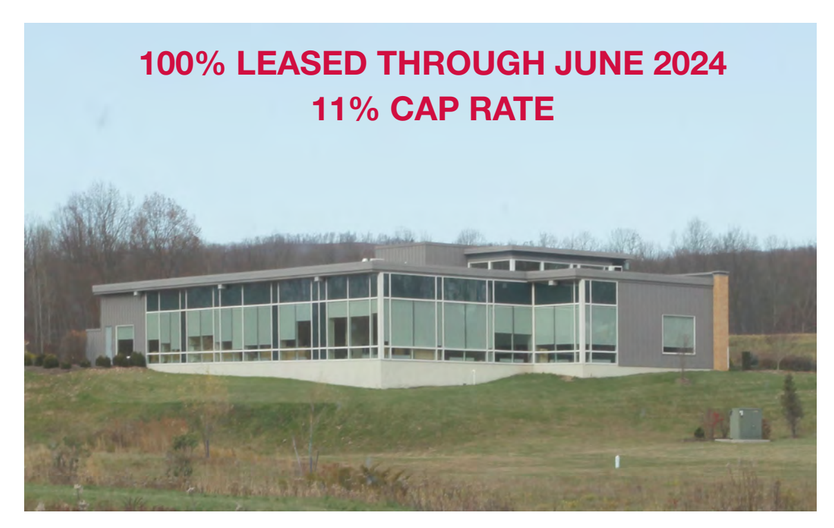
Located in close proximity to I-80, I-81 and Route 309

Tenants include Commonwealth of PA and international food company