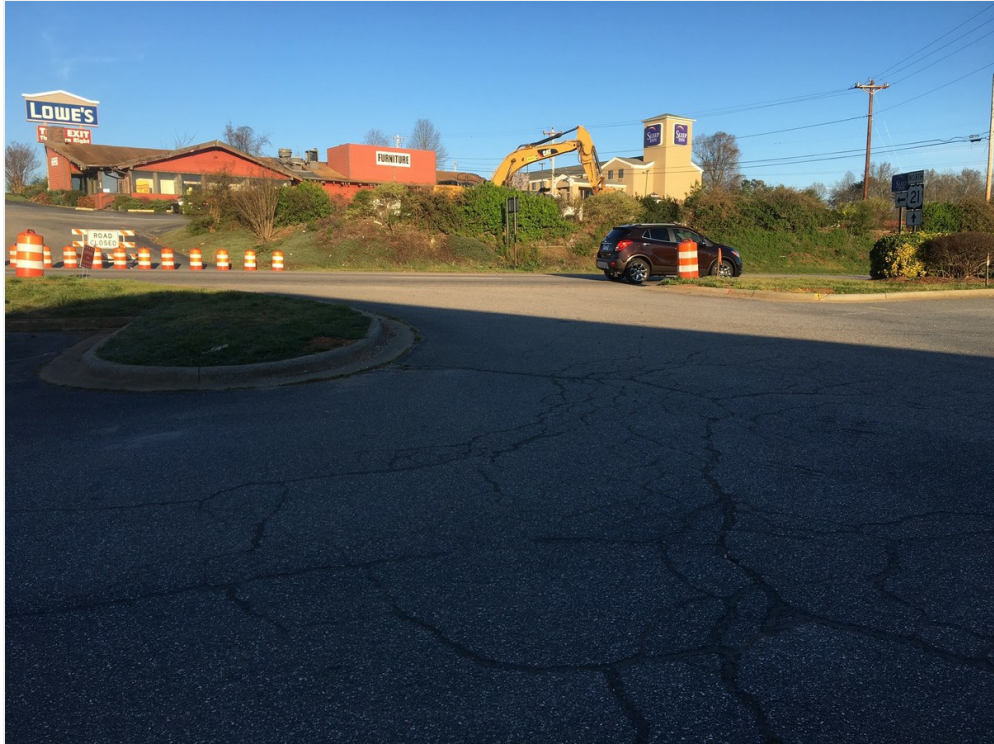
Road Improvements nearing completion