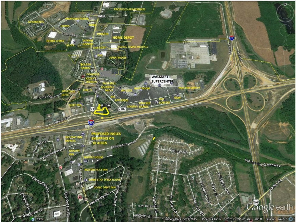
Statesville's Main Retail Area