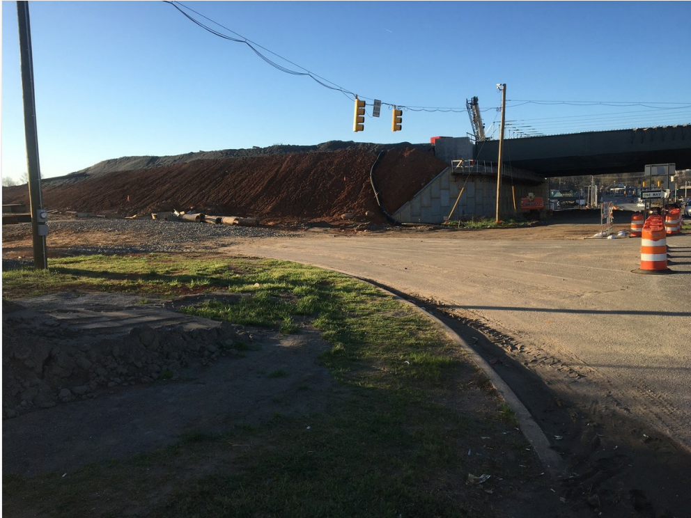
Right at West Bound off Ramp