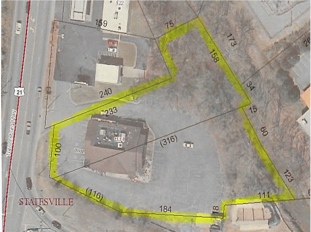
2 Acres Before Road Improvements