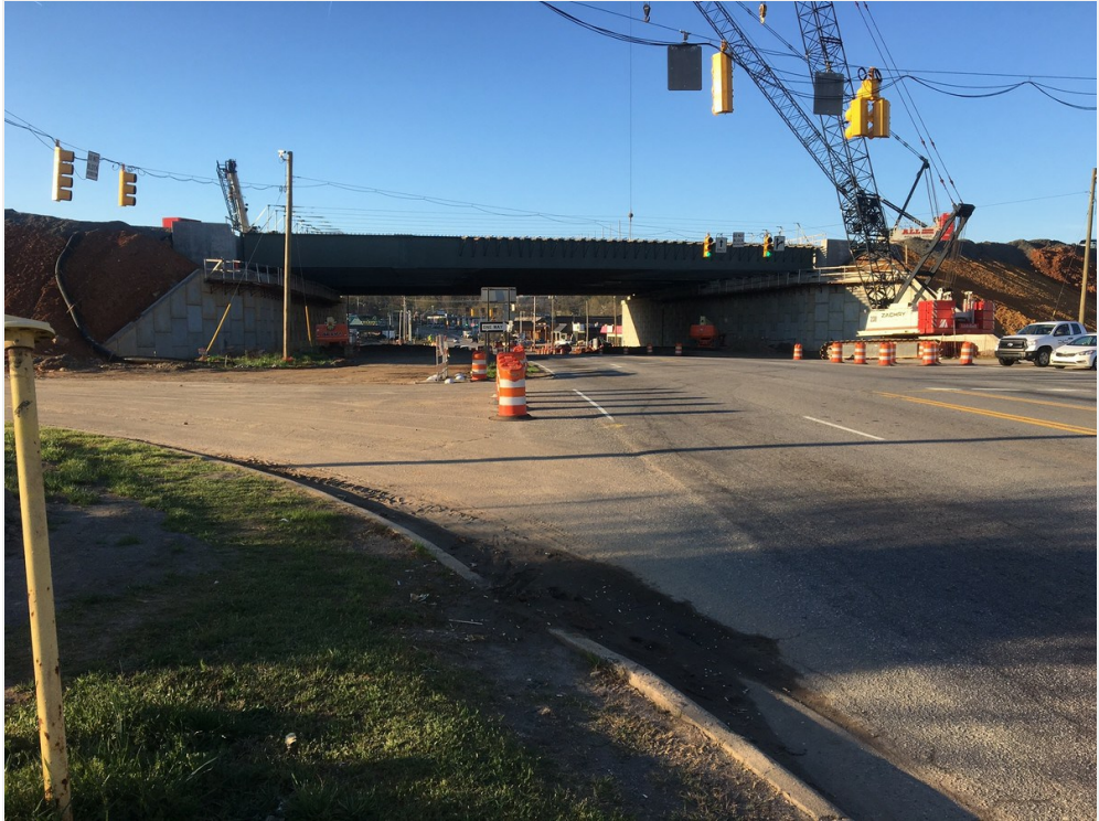
Relative to I-40