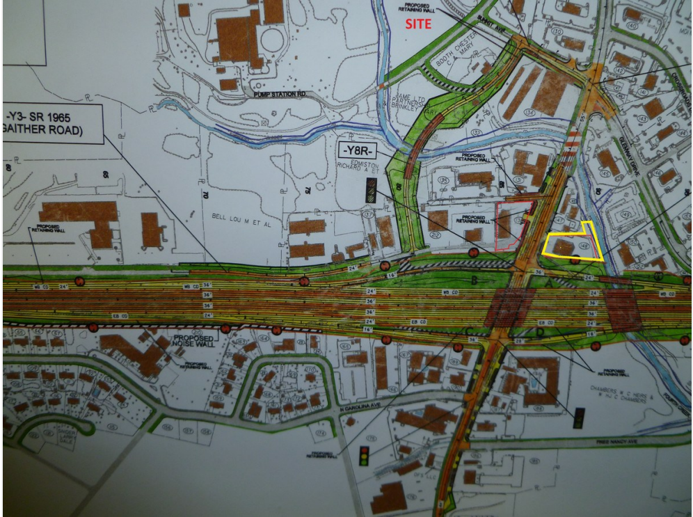
DOT Plan, Diamond Divergent Interchange for US 21 under I-40 which is being expanded to 6 lanes.