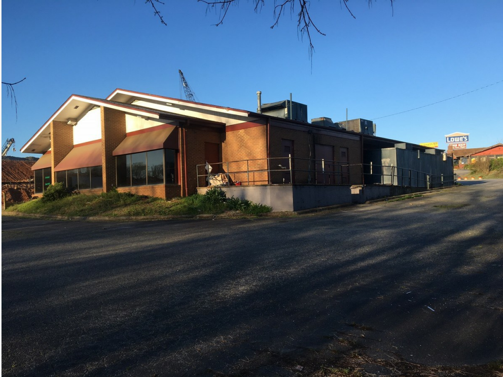
Side View, room for Drive Thru