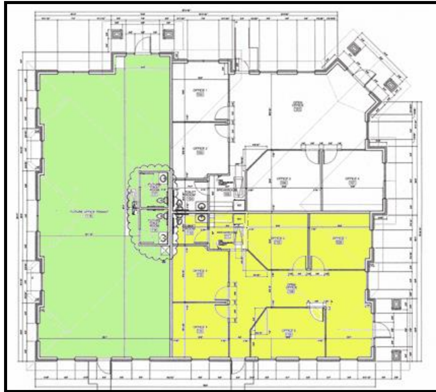
Suite 4-300 – 1,998 SF Suite 4-200 – 1,500 SF