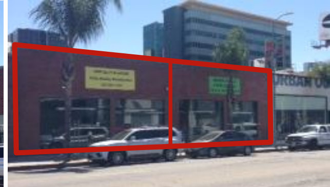
Space B | Space C