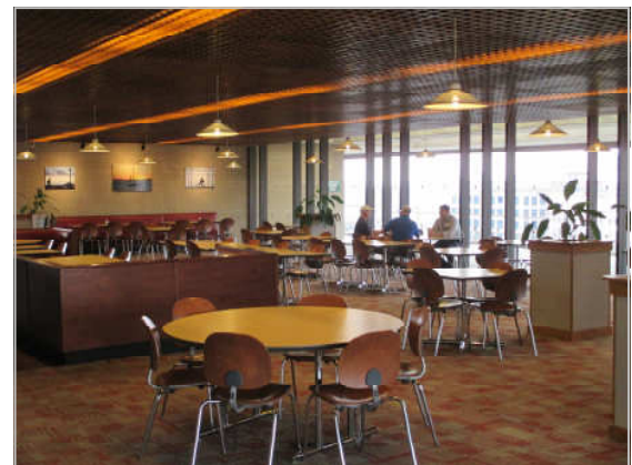
INTERIOR DINING AREA