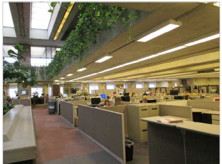
4TH FLOOR OFFICE SPACE AND ATRIUM