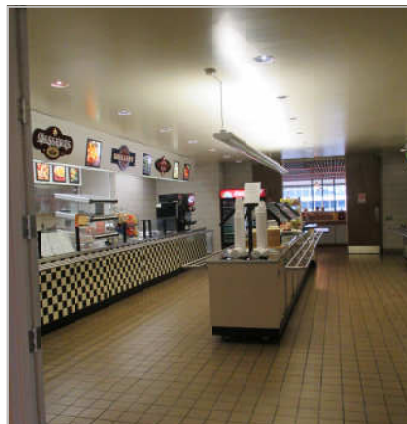
CAFETERIA SERVICE AREA