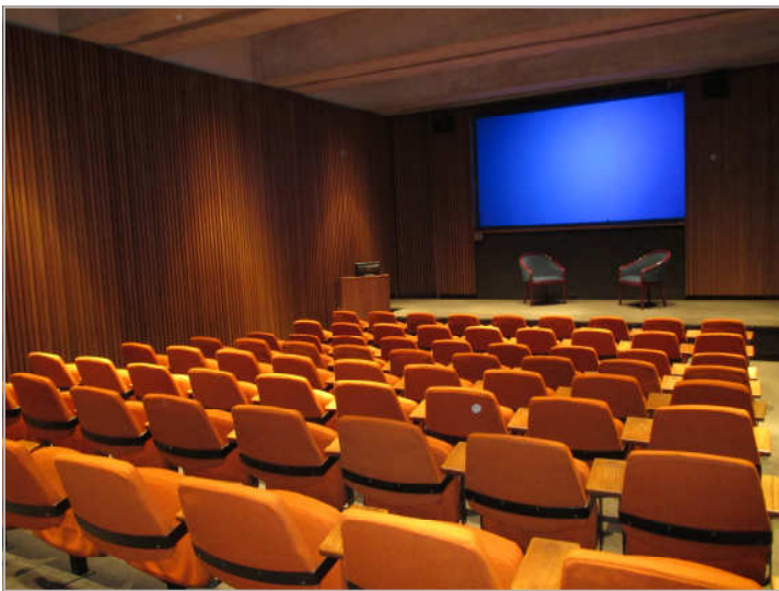
ONE NEWS PLAZA AUDITORIUM