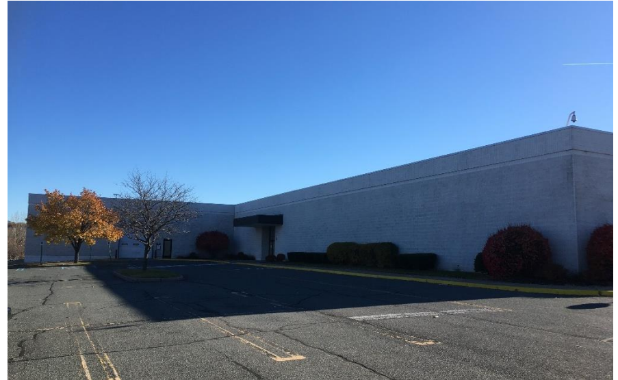
Auto Center Entrance