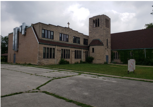
Fellowship Hall/Classroom Building