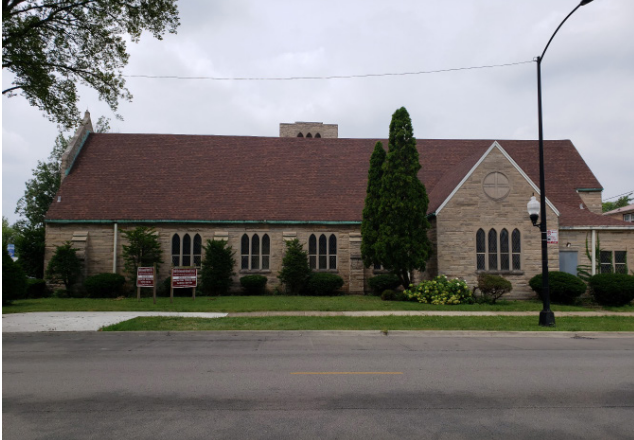
Side Exterior View