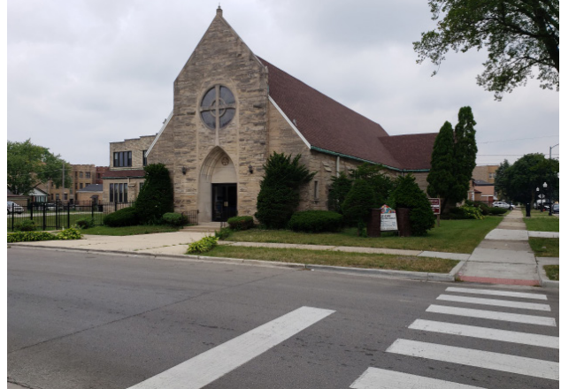
Side Exterior View