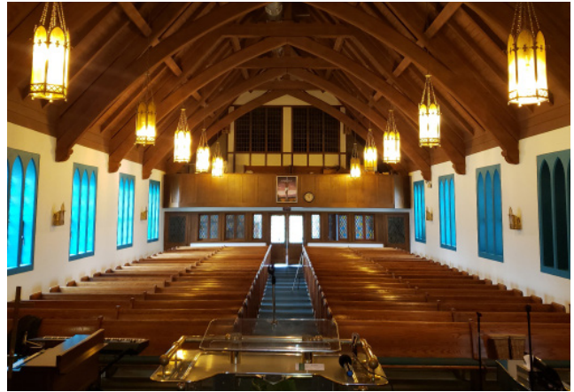
Sanctuary View from Stage