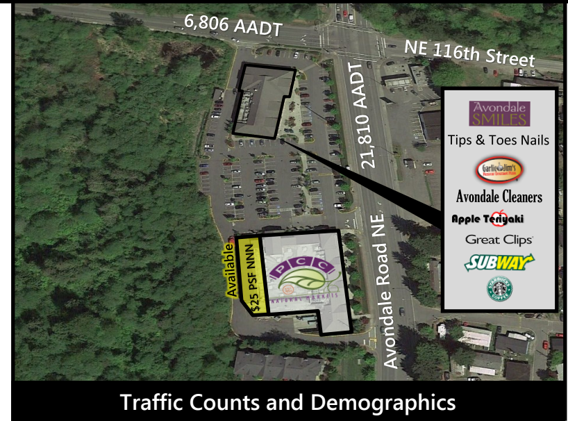
Traffic Counts and Demographics