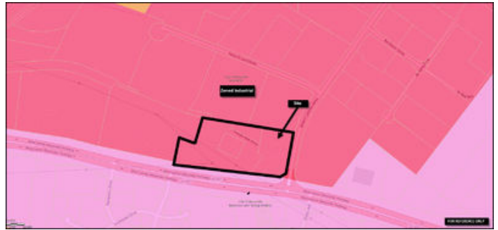
14. Zoning Map