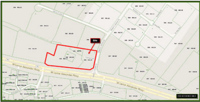
13. Tax Map