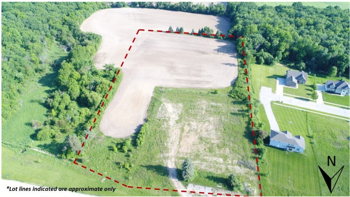
*Lot lines indicated are approximate only