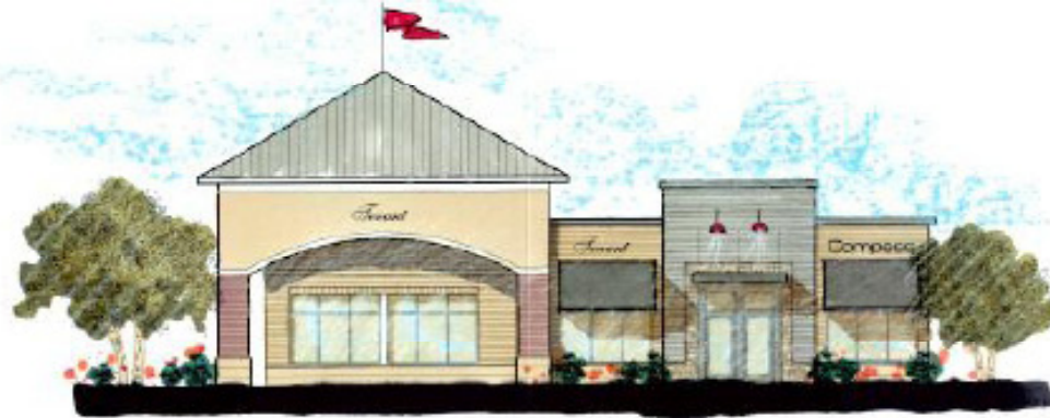
BISHOP ROAD ELEVATION (EAST) SCALE: 1/8" = 1'-0"