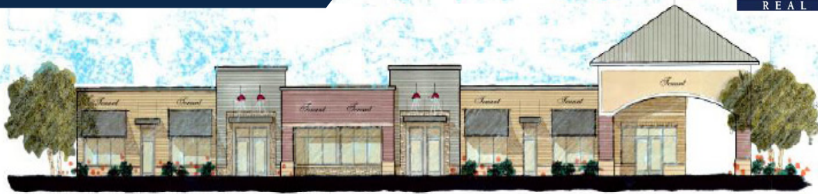
EDDY ROAD ELEVATION (NORTH) SCALE 1/8" = 1'-0"