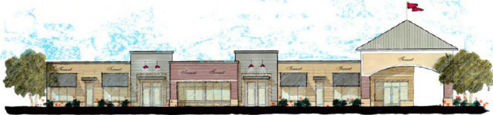
EDDY ROAD ELEVATION (NORTH) SCALE: 1/8" = 1'-0"