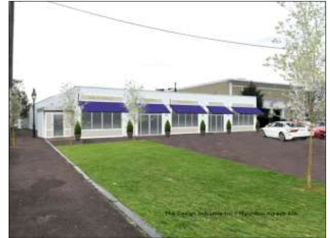
Architect's Renderings of possible changes in building facade

For more information about this opportunity contact: