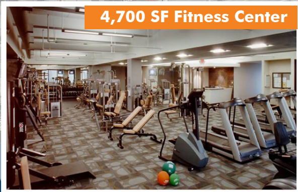
4,700 SF Fitness Center