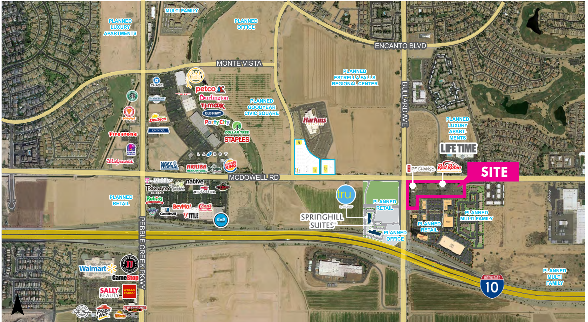
Site Outline Not to Scale

SEC BULLARD AVE AND MCDOWELL RD, GOODYEAR, AZ