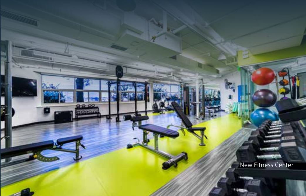
New Fitness Center