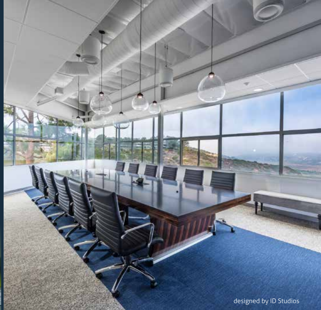
designed by ID Studios