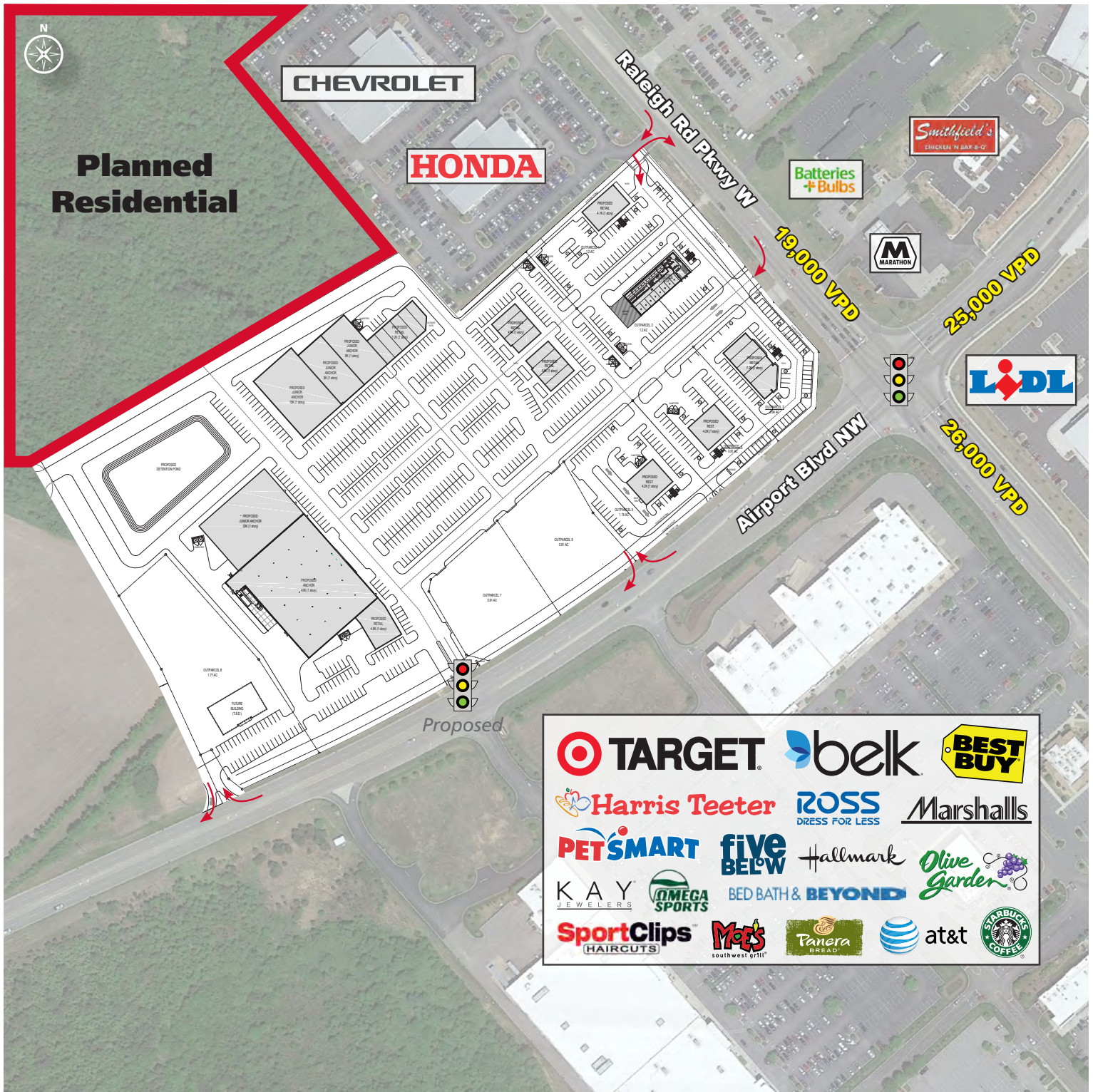
TRAFFIC COUNTS 2016 (NCDOT) 19,000 VPD on Raleigh Road Pkwy West

INTERSECTION OF RALEIGH RD PKWY & AIRPORT BLVD | WILSON, NC 27896