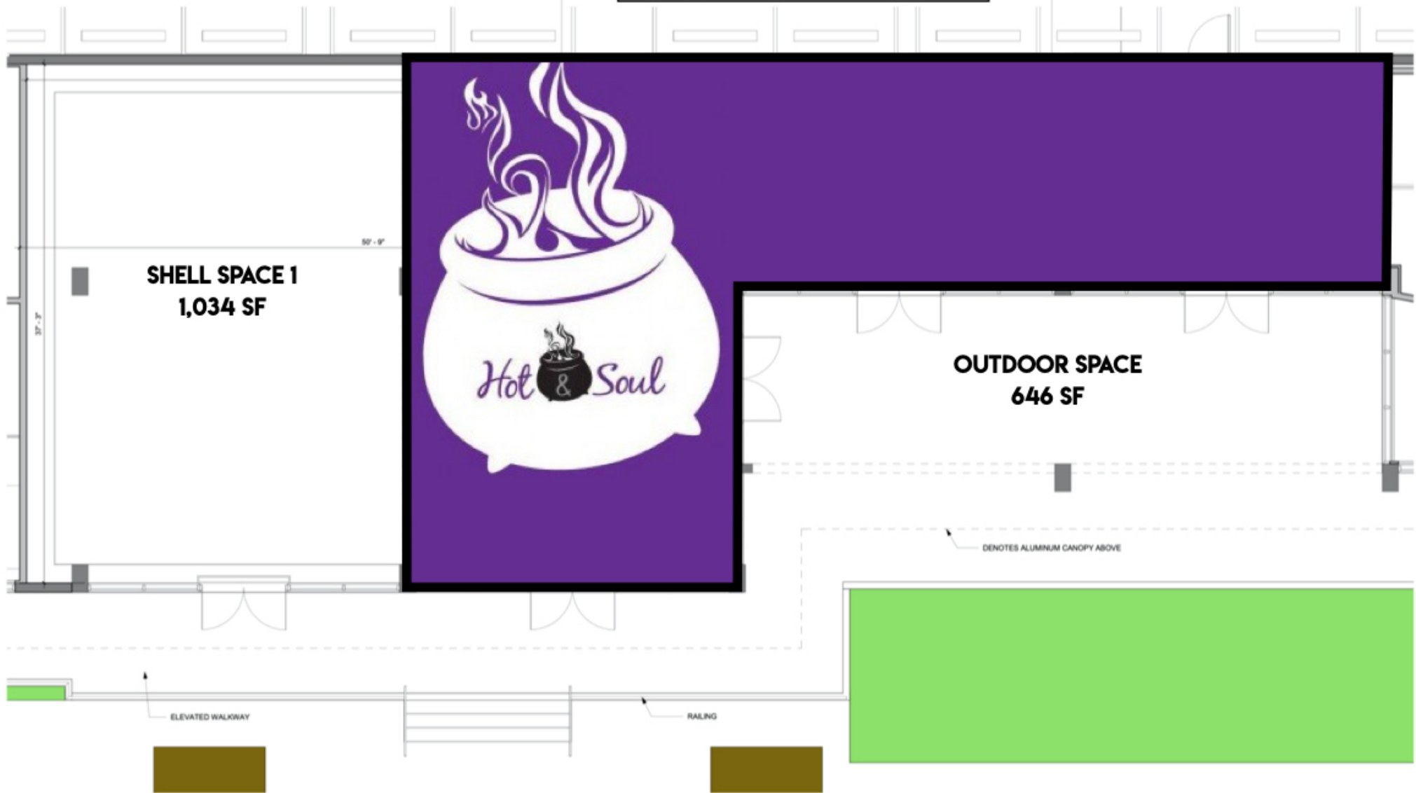
1 RESTAURANT ENLARGED FLOOR PLAN EX-R 1/4" = 1'-0"