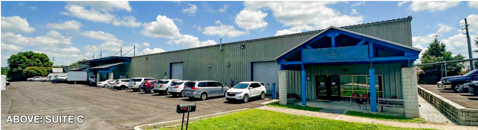
ABOVE: SUITE C