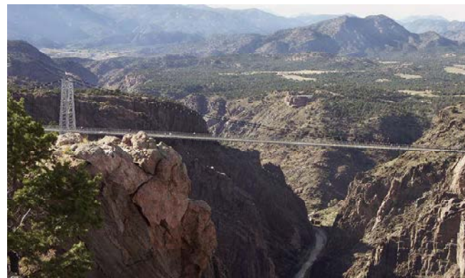
The Royal Gorge Bridge is the highest bridge in the United States. The bridge deck crosses the Royal Gorge 955 feet above the Arkansas River. The suspension bridge has a main span of 938 feet. The bridge is 1,260 feet long and 18 feet wide, and has a wooden walkway with 1,292 planks. The bridge is suspended from towers that are 150 feet high.