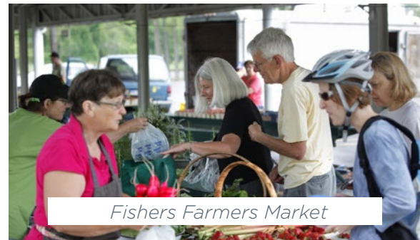
Fishers Farmers Market