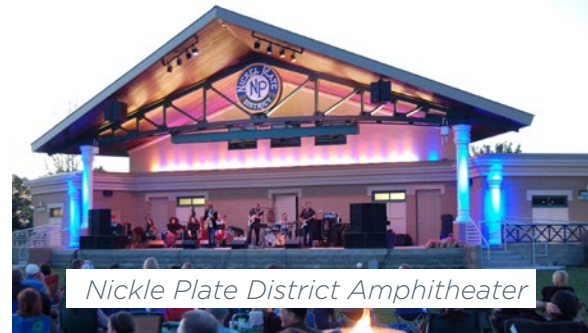
Nickle Plate District Amphitheater