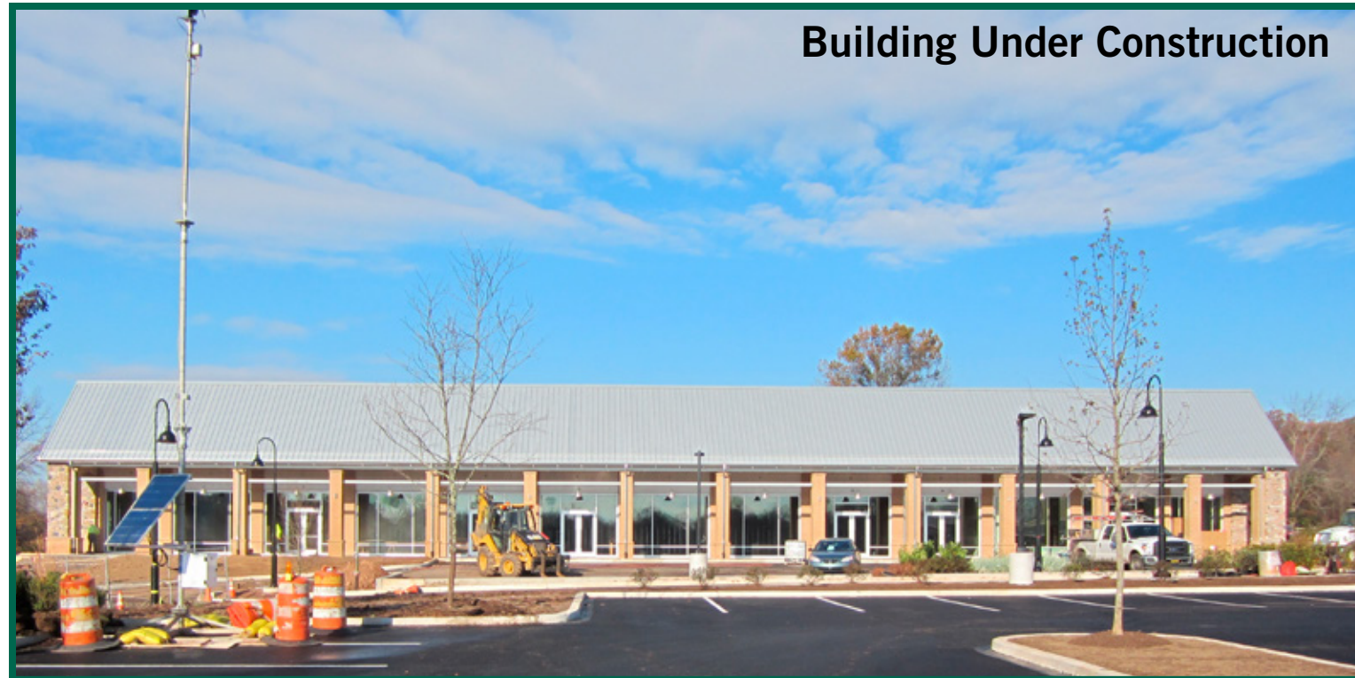
Building Under Construction

1111 Bethlehem Pike Spring House, PA 19477