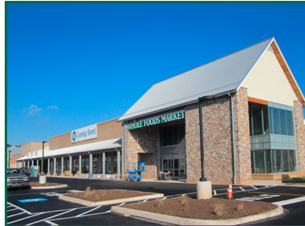
Upscale Whole Foods Grocery Anchored Center

1111 Bethlehem Pike Spring House, PA 19477