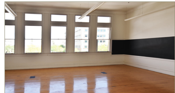
Second Floor Suite Interior