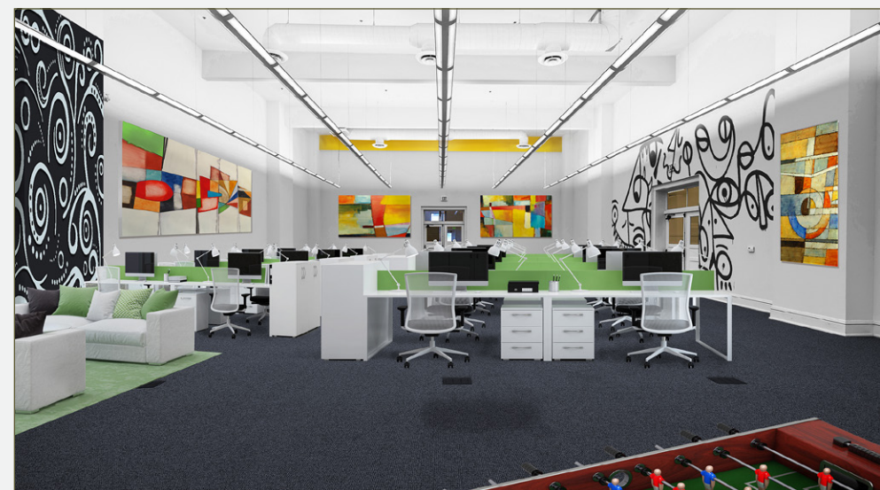
3,226 SF First Floor Great Room