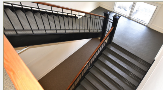
Staircase Connecting Floors One and Two