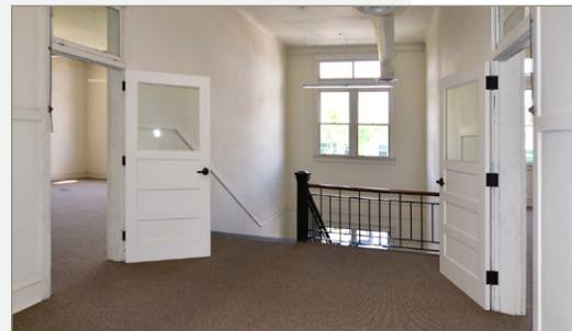
Second Floor Hallway