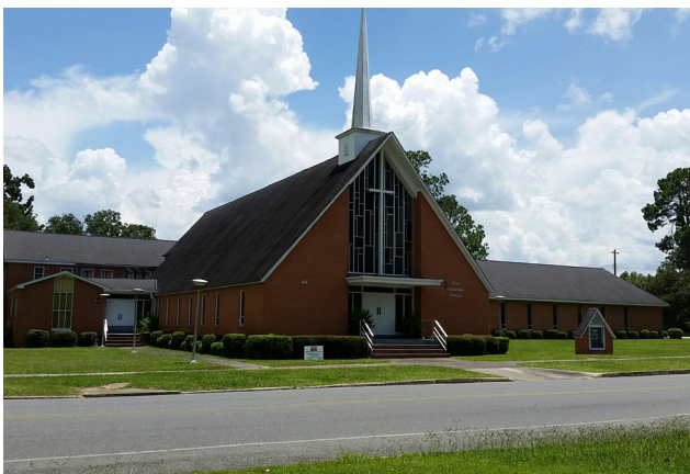
McDonald St. View