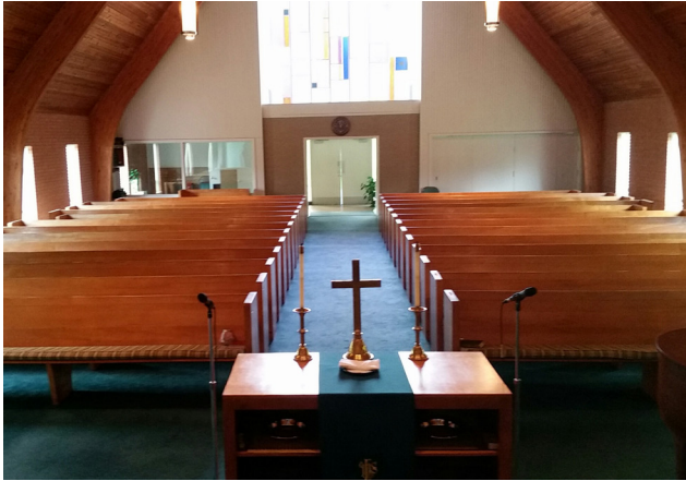
Sanctuary Front View