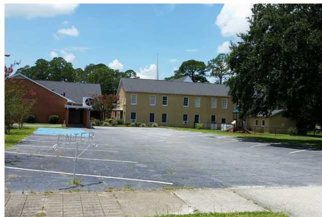
Folks St. View