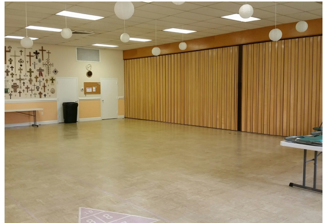
Fellowship Hall Divided