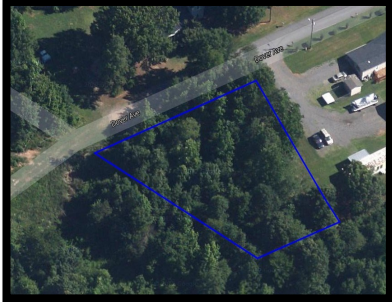
Parcel ID 12186 .5 Acres

Sale Price Determined by Offers—All Offers will be Considered