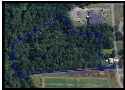
Parcel ID 13912 8.9 Acres