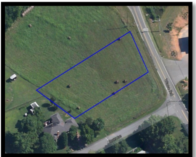
Parcel ID 12196 .5 Acres