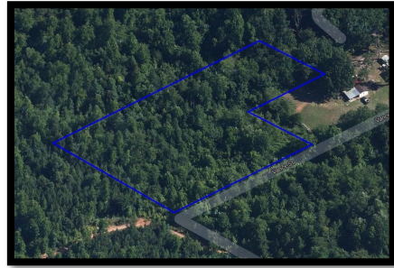
Parcel ID 12221 2.5 Acres