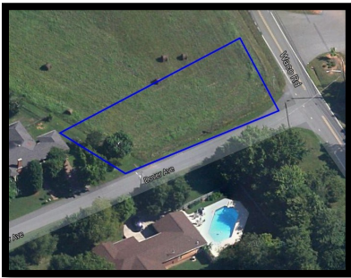
Parcel ID 12195 .3 Acres