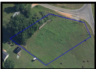
Parcel ID 12197 1.1 Acres