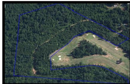
Parcel ID 59701 38.7 Acres