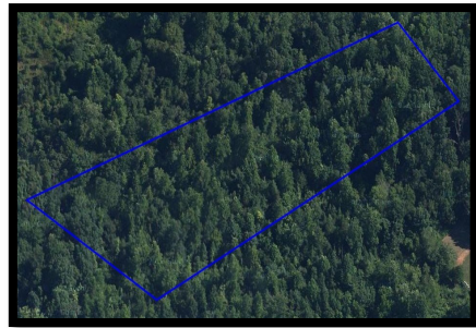
Parcel ID 12229 3.2 Acres