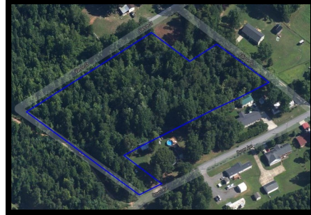
Parcel ID 12205 3.96 Acres