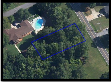
Parcel ID 12193 .3 Acres