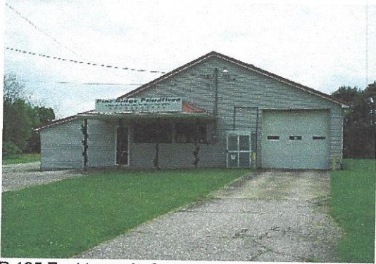
SR 125 East towards Georgetown on the right

Cross Street Gillette Station Rd Tax ID210416720100 Other Spec Fin Y Lease Only Available N Business Only for Sale Type Sub