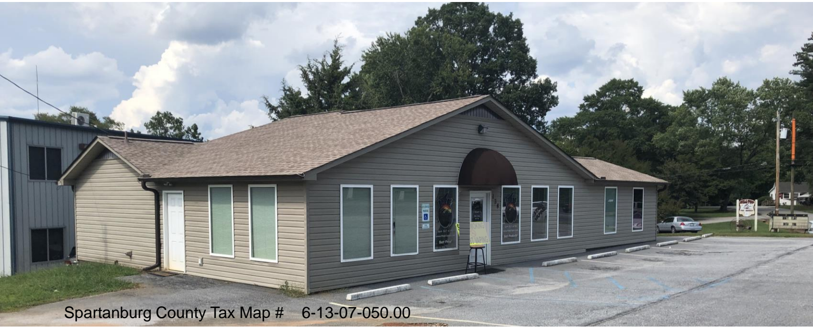
Spartanburg County Tax Map # 6-13-07-050.00