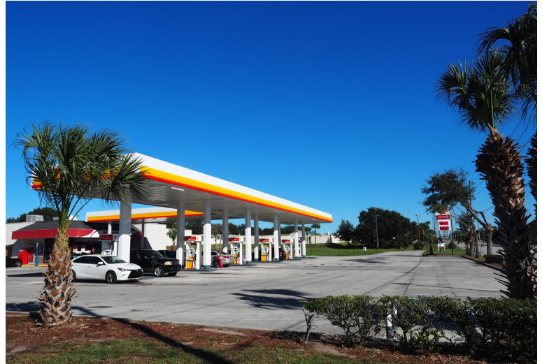
Shell Gas Station between the property and Lake Stanley Road