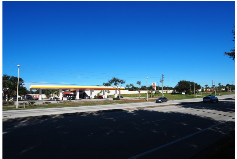
The property is to the right of the Shell Gas Station