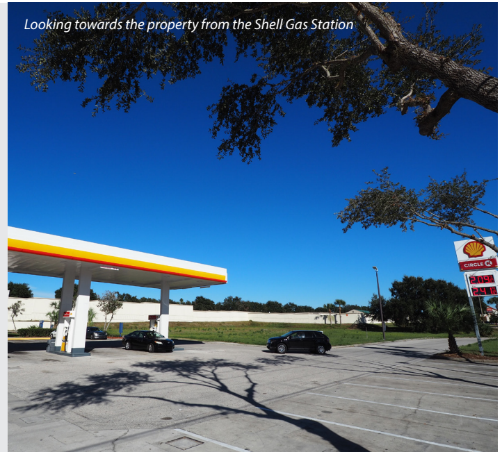
Looking towards the property from the Shell Gas Station