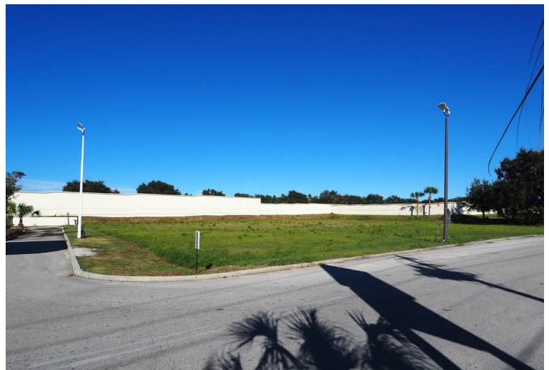
The subject property from Stanley Road