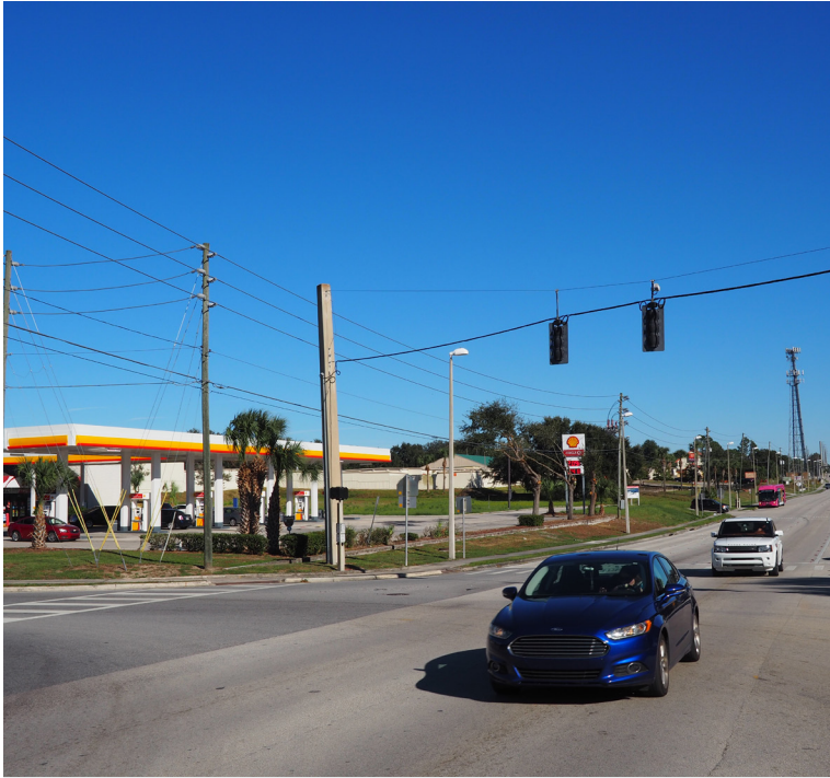
Looking east along Silver Star Road from Lake Stanley Road intersection