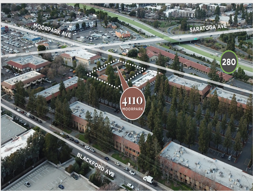
4110 Moorpark Ave.