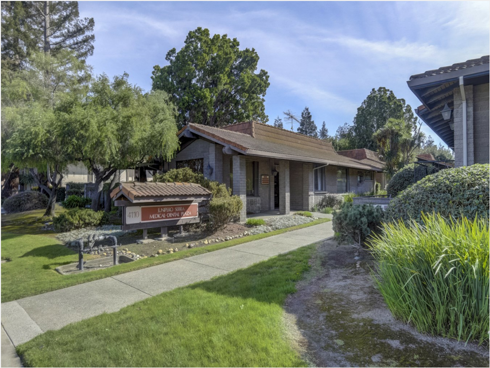
Junipero Serra Dental Plaza