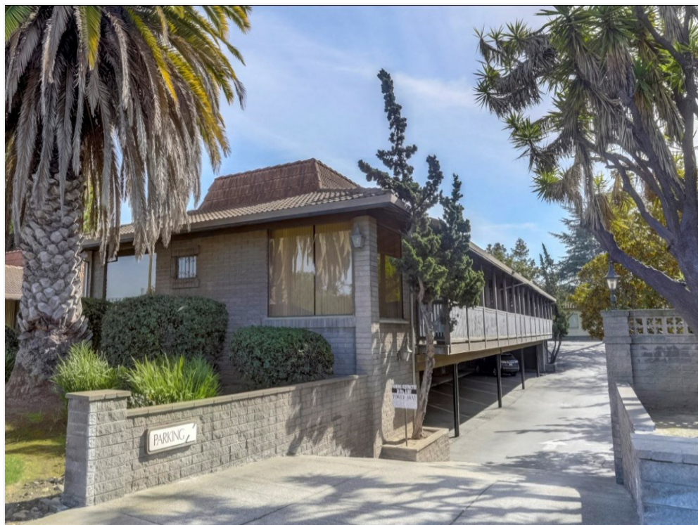
Parking & Storage