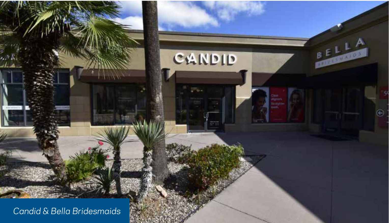
Candid & Bella Bridesmaids