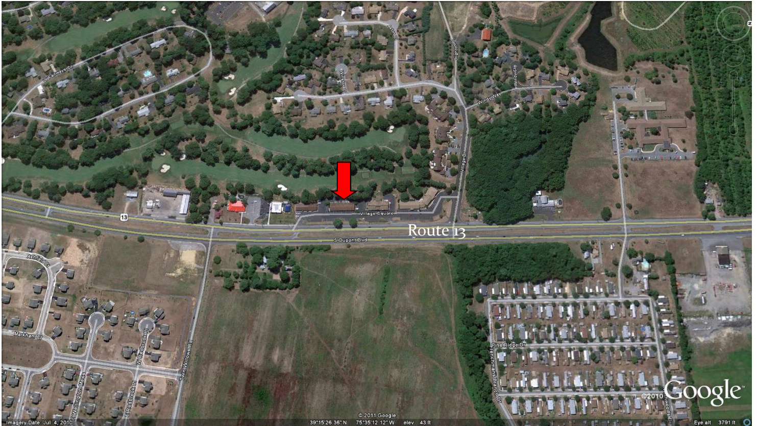
Office building located on Route 13 just south of town limits of Smyrna