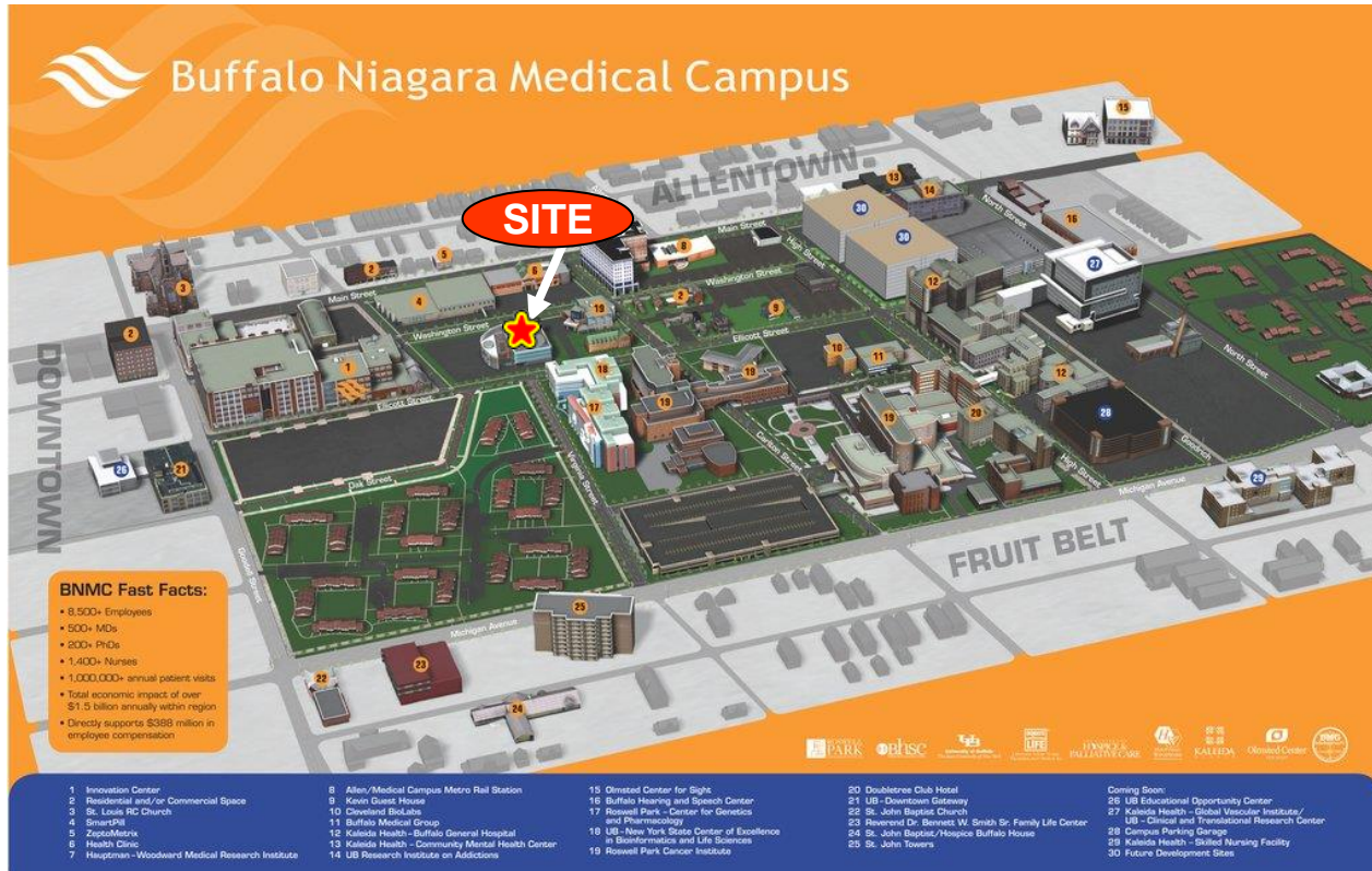
Buffalo Niagara Medical Campus Map